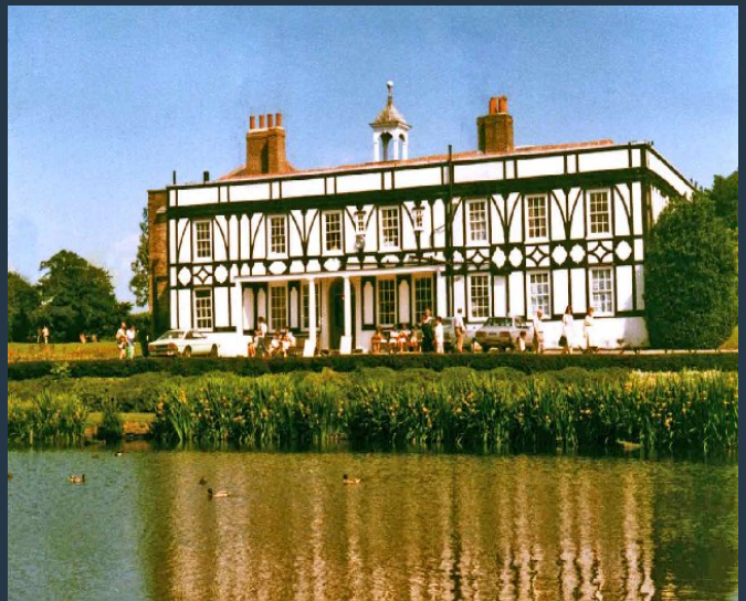
Broomfield House c.1980 prior to damage caused by a series of fires.

Palmers Green Station is located circa 0.6m to the east of the property and provides links into London by both National Rail and via the Piccadilly Line.